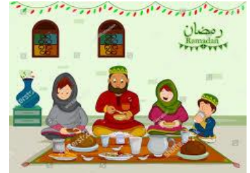
Iftar at home